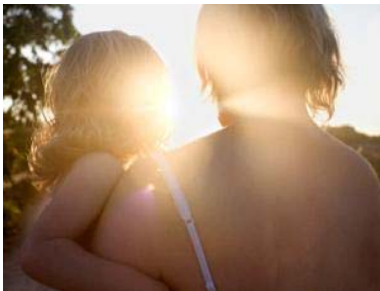
Vitamin D production is light work

The case has highlighted a resurgence in rich countries of the potentially fatal diseases that result from a lack of vitamin D (see "Rickets is just the start" ). Irene Scheimberg , the clinical pathologist at the Royal London Hospital who discovered Jayden's rickets, says there is evidence to suggest vitamin